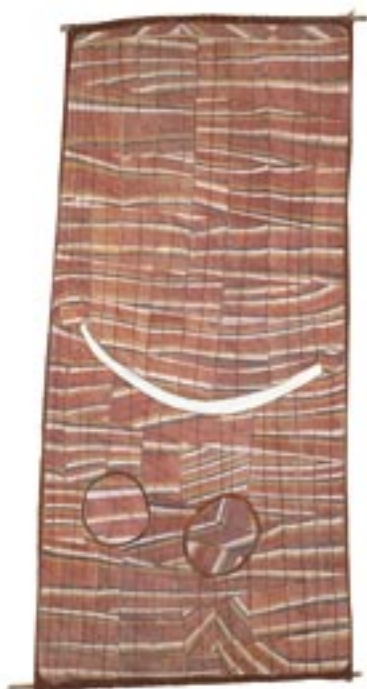
2003 Clemenger Contemporary Art Award 19/09/2003 – 23/11/2003

This long-awaited retrospective brought together 112 works by Charles Conder, about one third of which were drawn from the six years Conder spent in Sydney and then in Melbourne where he painted with Tom Roberts, Frederick McCubbin and Arthur Streeton in the group now known as the Heidelberg School. The remaining works included examples of the landscape and pastoral subjects he painted in Normandy under the influence of Claude Monet and his late imaginative watercolours on silk including a number of painted fans; seascapes and beach scenes.