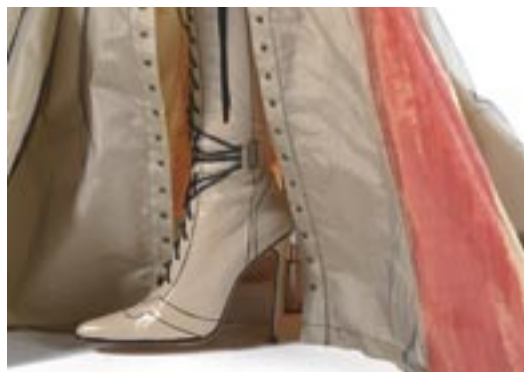
House Mix: Highlights of the International Fashion and Textiles Collection 4/12/03 – 29/08/04

Myer Fashion and Textiles Gallery Principal Sponsor: Myer