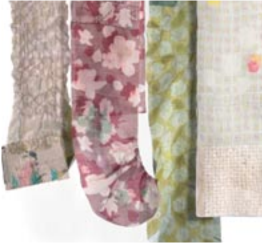
Pins & Needles : Textiles and Technique from the Australian Collection