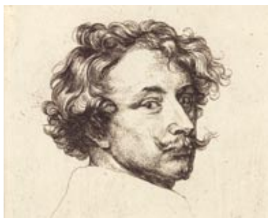
Surveying the Centuries: Highlights from the Prints and Drawings Collection 04/12/2003 – 21/03/2004

Like a club DJ sampling music on the dance floor, the exhibition House Mix interpreted the Gallery's collection in new sequences, where works were arranged in engaging narratives that move across historical, modern and postmodern times. The fusion of historical and contemporary fashion presented a context in which to thoughtfully examine concepts of dress, form, reference and creation within the intricate web of artistic hierarchies and cultural protocols. A series of clothing ideas were tracked through distinct groupings, relating works in a visually harmonious and thematic dialogue.