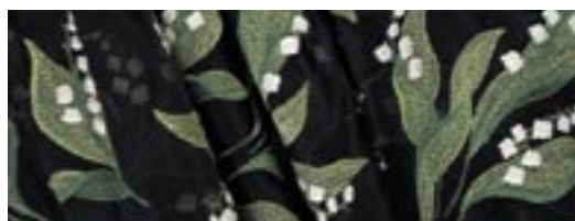
Penelope Davis Born Australia 1963 Red 2 2000 From the Penumbra [where shadows become light] series 2000 type C photograph 78.5 x 104.5 cm Purchased with funds arranged by Loti Smorgon for Contemporary Australian Photography, 2000