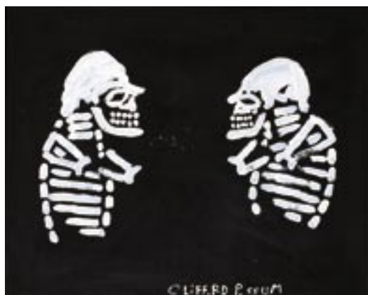
Clifford Possum Tjapaltjarri 24/03/2004 – 03/05/2004

An Art Gallery of South Australia Travelling Exhibition National Tour Sponsor: Santos Supported by: Visions of Australia, Gordon Darling Foundation