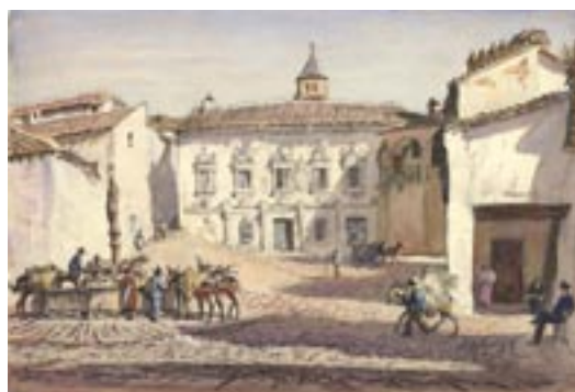
Lionel Lindsay: An Antipodean Spain 13/12/2003 – 15/02/2004