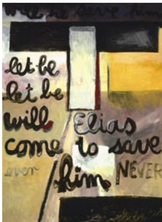
Colin McCahon: A Question of Faith 04/07/2003 – 07/09/2003

The exhibition was curated and toured by the Stedelijk Museum Amsterdam with organisational support by Auckland Art Gallery Toi o Tamaki.