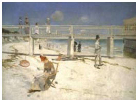
Charles Conder 1868 – 1909 05/09/2003 – 09/11/2003

An exhibition from the Art Gallery of New South Wales