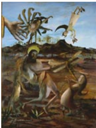
1 Sidney Nolan born Australia 1917, lived in England 1953–92, died England 1992 Temptation of St Anthony 1952 oil and enamel paint on composition board 121.8 x 91.3 cm Purchased through the NGV Foundation with the assistance of an anonymous donor, and the proceeds of The Impressionists Gala Dinner at NGV International, 2004 2004.1