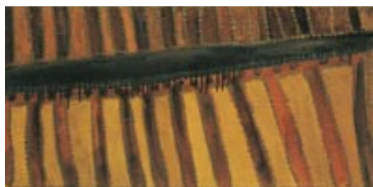
Sidney Nolan: Desert and Drought 06/06/2003 – 17/08/2003

Rover Thomas gained international recognition for the distinctive style of painting that depicted his distinct awareness of the land and his special affinity with pigment. The exhibition presented 19 large-scale works by Rover Thomas.