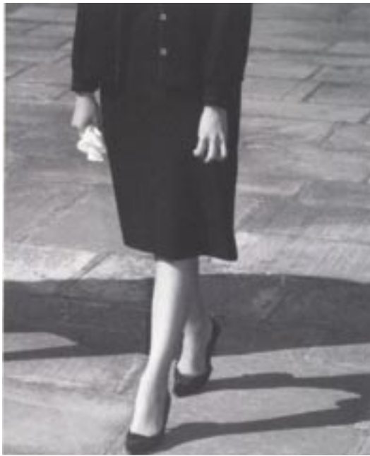
Good Looking : Narrative Photographs

Pins & Needles brought together more than 30 contemporary, historical, functional, wearable and purely decorative works from the NGV's Australian Fashion and Textiles collection. Exploring a diverse range of textile techniques, this exhibition included everything from quilting, embroidery and screen-printing, to weaving, crochet, knitting and beyond. The range of works gathered for Pins & Needles celebrated the richness of our local textile design heritage through the distinctive and innovative approaches that Australian textile artists past and present have developed.