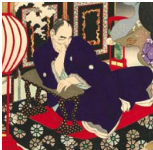
Resonance: Highlights of the Asian Art Collection 04/12/2003 – 26/04/2004 (closed 26/12/03, re-opened 2/04/04)

The NGV has one of the most impressive collections of Asian Art in the country. This display revealed its diverse nature and the interactions of artistic culture and style. Highlights included: Indian Miniatures; Hindu and Buddhist sculptures and painting; Chinese and Japanese Buddhist sculpture and painting; Chinese scholar paintings and calligraphy; Chinese court academy painting; and Japanese screens, painting, calligraphy and Ukiyo-e prints.